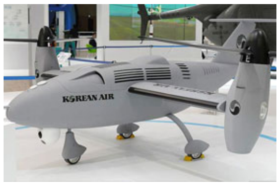
KOREAN AIR UNVEILS KUS-VS DRONE PROTOTYPE