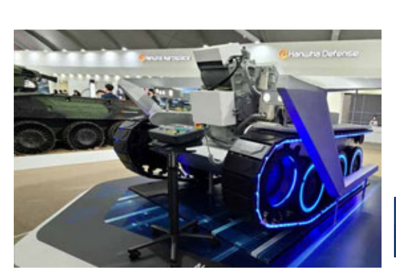
HANWHA DEFENCE TARGETS HYBRIDELECTRIC TRACKED VEHICLE FUTURE

Korean Air, currently in the process of developing a VTOL Surveillance UAV System, is showcasing the protype of the drone at the ongoing ADEX.