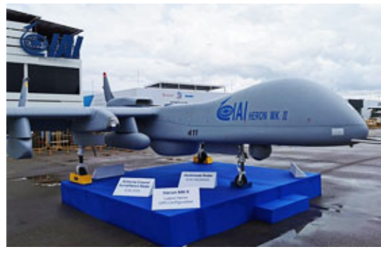
HERON MK II: IAI IN DISCUSSIONS WITH MULTIPLE POTENTIAL BUYERS