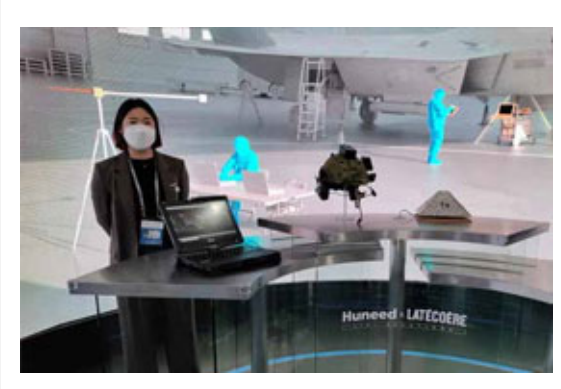
HUNEED TECHNOLOGIES TO SIGN LIFI JV WITH LATECOERE