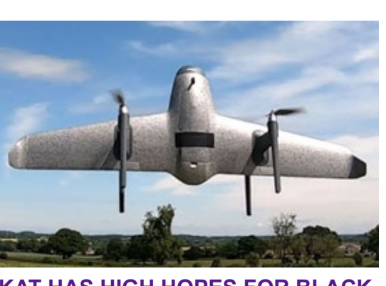
KAT HAS HIGH HOPES FOR BLACK SWAN