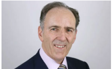
"There is an Increase in SAF Production Globally, but We Still Have a Long Way to Go"