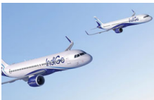
Airbus Wins Largest-Ever Order in Commercial Aviation History, from IndiGo