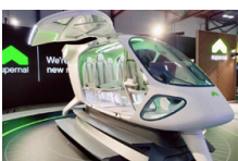
Supernal and TruWeather Solutions to Introduce Real-time Micro Weather Forecasting for AAM Sector

GLOBAL BUSINESS PRESS PTE.LTD 30 Cecil Street, #19-08 Prudential Tower, Singapore 049712 Tel: +65 6850 5269 Fax: +65 6438 2436 Email: enquiry@gbp.com.sg