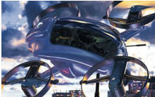
TE Connectivity Showcases Full Range of Solutions