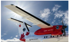
RTX Advances Hybrid-Electric Propulsion Demonstrator