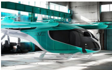
Eve Air Mobility Names Three eVTOL Suppliers