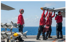
Raytheon Wins US $264 Million US Navy Modification Contract to Produce AIM-9X missiles