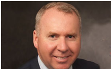
Boeing Sees Demand for Heavy Lift & Attack Helicopters